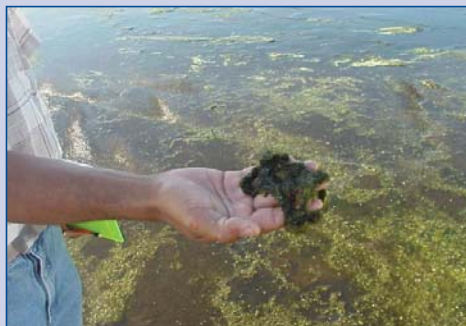
Algae is another product that is recycled and fed back to local livestock.