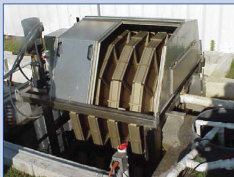
Hydrotech Disc Filters are designed for High flows and fine filter openings. Hydromentia employs 10 micron filter elements to reduce phosphorus and prevent hyacinth seeds from escaping the system.