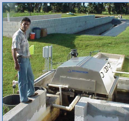
Hydromentia's system requires very little labor.