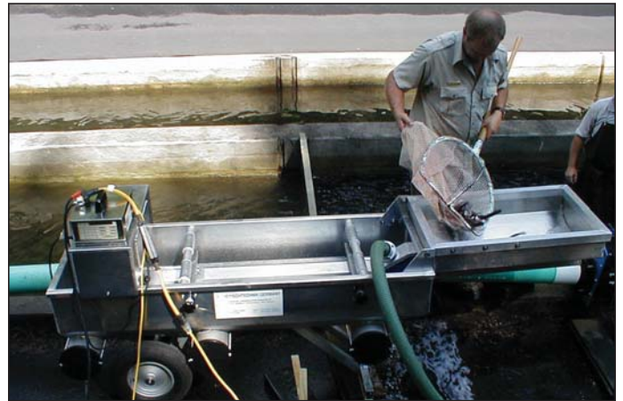
Trout Grading at Chattahoochee NFH