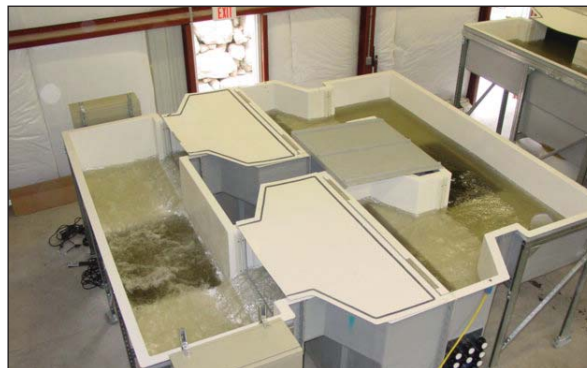
Overhead view – 2,500 gpm flow

Two intake filtering systems, utilizing similar IMF UV contactors are scheduled for installation in 2004. These systems, for state hatcheries in the western U.S., are coupled with Hydrotech Drum and Disc filters to form a complete packaged intake filtration system.