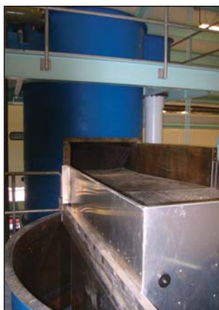
WMT LHO (foreground) shown coupled to CO 2 degassing tower

Water Management Technologies installed Hydrotech Drum filters and Low Head Oxygenators (LHOs) at the recently renovated White River National Fish Hatchery (Vermont). The hatchery converted eight of their 30' diameter tanks into two (2) 4-tank partial re-use systems for the production of Atlantic salmon ( Salmo salar ).