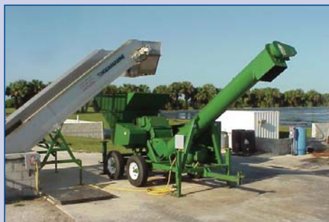
A conveyor and chopper process the hyacinth to a form that can be fed to local area livestock.