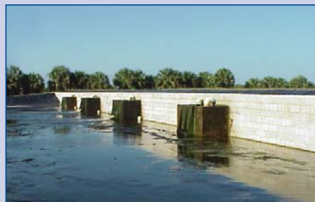
Head boxes feed the inclined algae beds.