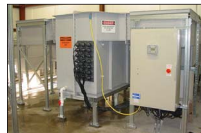
Side view of biofilter inlet UV with lamp field visible

Over the past several years, outbreaks of Ich have impacted the normal operation of the facility by requiring formalin treatment. To further control the outbreaks, the hatchery was forced to discontinue utilizing the re-use system and run the facility as straight "flow through" system utilizing all four (4) wells, normal operation required two (2). Due to the inability to run the re-use system, the hatchery on several occasions had to stock the fish early. Outbreaks would appear in the system 2-3 weeks after running the re-use system indicating that Ich had established itself within the system despite repeated chlorine and drying treatments between production runs.