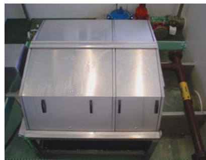
Hydrotech 1603 IA Drum filter with open inlet channel

The LHOs were designed to meet the specifications, size and connections required of the system. Each unit was constructed in 5052 marine grade aluminum and are 6' x 6' x 5.5'. An inlet flange was designed to meet up with an FRP transfer channel (from the CO 2 stripper) and had integral cradle arms to support the LHO over the effluent sump.