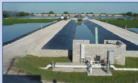
Hyacinth beds are harvested on average twice a month. Inclined algae beds are fed nutrient rich water from head boxes located at the head end of the bed. A Hydrotech Disc Filter Model HSF 1704 is located between the hyacinth and algae as the final filtration step in the process.

elements because of its compact, robust design. The Disc Filter acts as a polishing filter at the end of the process. Samples taken up and downstream of the Disc filter indicate a reduction in phosphorus as well as prevention of water hyacinth seeds from escaping into the environment. Water hyacinth is harvested weekly from the system, and fed to livestock in the area. Pictured is a prototype system which is performing extremely well. Hydromentia will likely be installing full scale systems like this one in the near future.