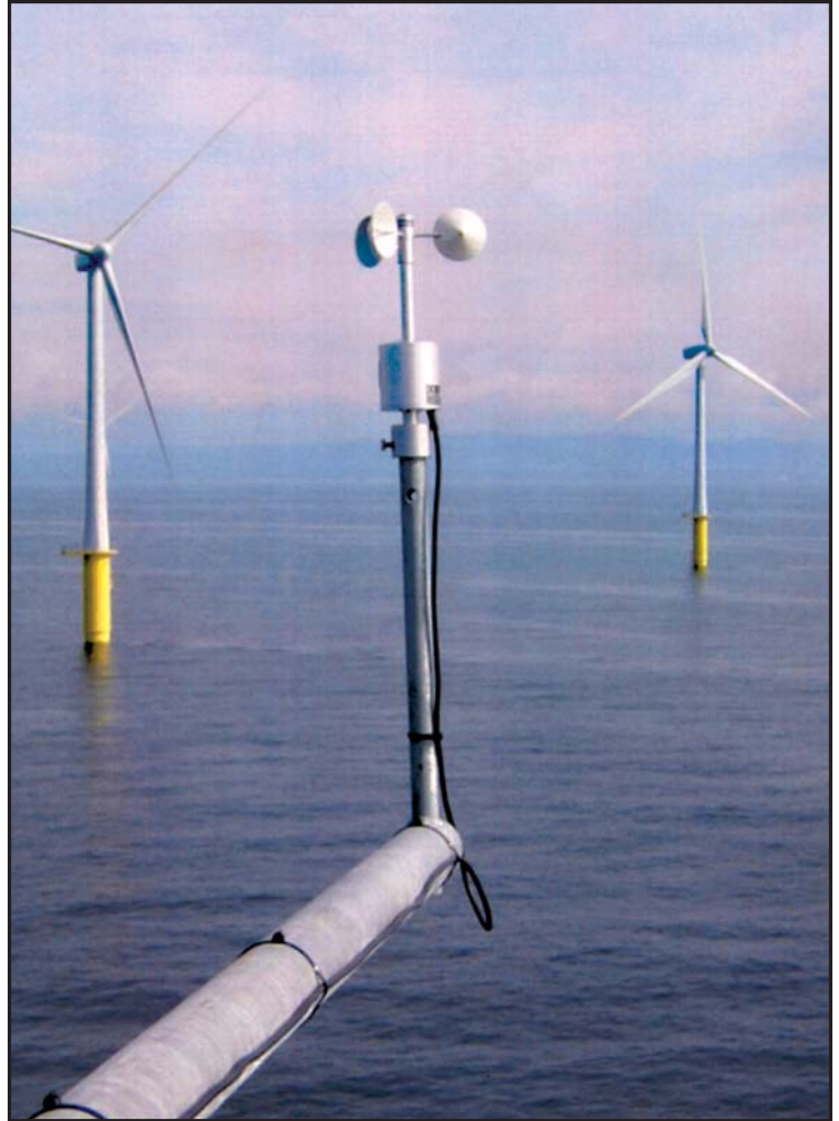
View from one of the anemometers on the meteorological tower to the monopiles and turbines of the wind farm.

Wind speed, wind direction, temperature, pressure