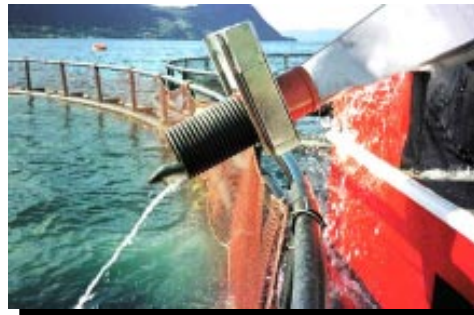
Fish Counter at work

The counter is not dependent on the fish passing one by one. When several fish pass simulta-