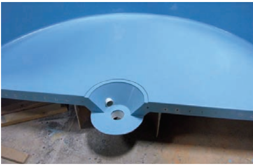
WMT's Dual Drain Tank

We specialize in specialty tanks of many kinds, meeting your designs and specifications or helping you engineer and structure a tank or a system of tanks – above ground or in ground – that works for you. Our wide and varied background for over 35 years has included the manufacturing of swimming pools and spas, fish ponds, aquarium tanks and hazardous waste containers, in addition to our aquaculture products.