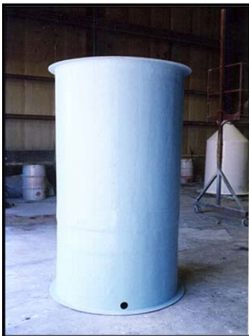
CONE BOTTOM REARING TANK