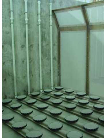
Commercial Trout Farm - Mega-IMF Biofilter with Air Grids and Media Screens – 5,400 gpm – 4,000 ft 3 media (113m 3 )