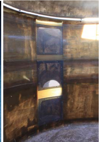
Numana Tribal Hatchery – Custom Biofilter Shell and Media and Media Screens – 2,000 gpm, 500 ft 3 media (14m 3 )