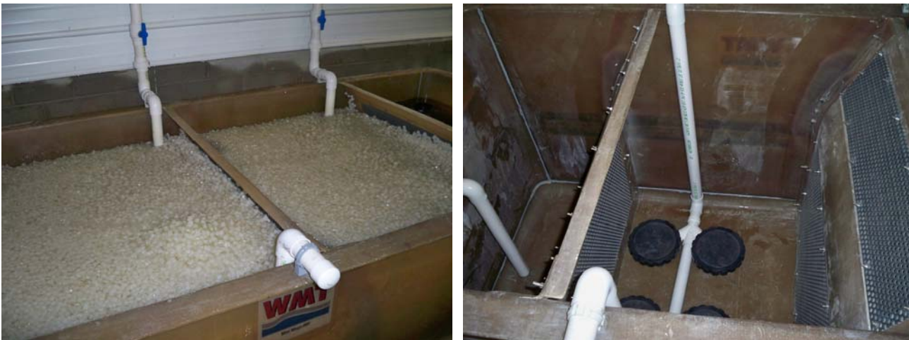
Commercial Tilapia Farms - Mini-IMF Biofilter with Air Grid and Media Screens – 180 gpm, 145 ft 3 media (4.1 m 3 )